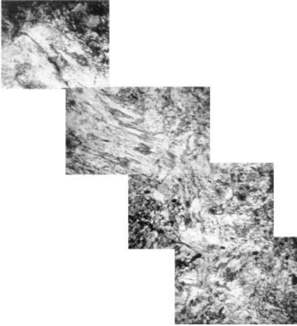
Fig. 3. Fine structure of 12Kh18N10T steel ( \times 12,000 ).

In a rigorous formulation, the rather complex solution of the three-dimensional unsteady problem of determining the parameters of jet motion in a target becomes even more complicated in describing the penetration process in nonlinear fractal media because the classical models of continuum mechanics are unsuitable for describing their elastic and other properties. Thus, fractional derivatives and fractional integrals appear in the equations of motion and conservation [5], and the physical properties of fractal materials are determined by dependences of material density on its structure and dependences of elastic modulus on deformation scale [6].